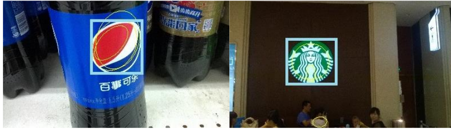
Fig. 2 Results of rapid estimation method on mobile phone

Examples of the detection procedure are shown in Fig. 2. As example shows, the rapid estimation method can detect the logo region efficiently.