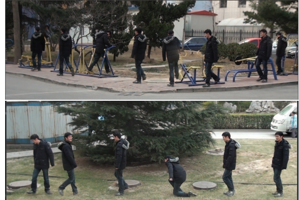
Fig. 4. Two narratives from real surveillance videos.

In this paper, we have proposed a novel video presentation called video narrative to summarize a specific event of object in the source video. Representative objects are selected and illustrated in a single image, to maximally preserve the behavior or event information of the specific object. The experimental results are convincing for a first stage. We believe that this kind of video presentation has large applications in video indexing, fast browsing and video summarization.