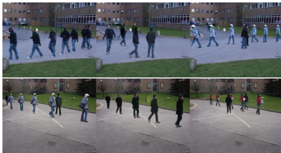
Fig. 3. Six narratives generated from clips of two different scenarios in PETS2009 database.